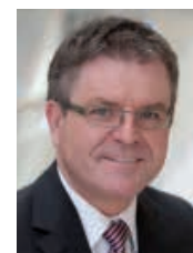
Wilhelm Haselmeier GmbH & Co. KG

Find out more about the opportunities for startups in the pharmaceutical and biotechnology industry, as well as MedTech startups, to bring new active ingredients onto the market with the innovative pen injection systems made by Haselmeier. Call us on +49 (0) 711 71 97 90 or send an e-mail to info@haselmeier.com